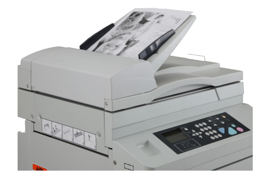
Automatic Document Feeder